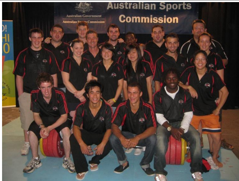
Hawthorn Team – full of strength and smiles !!