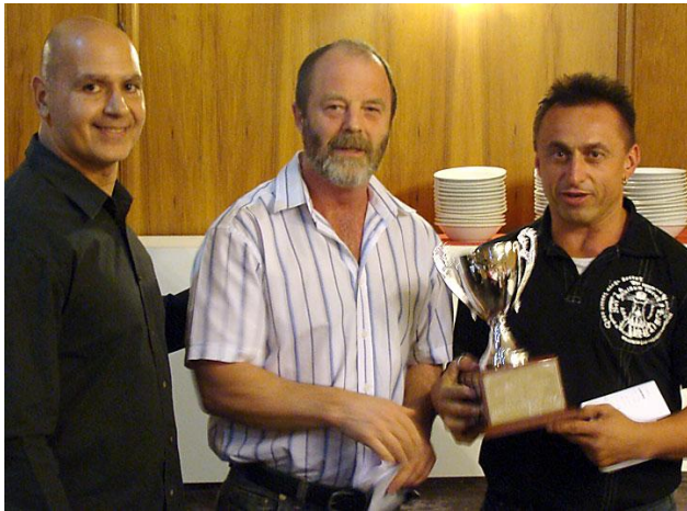
Victoria wins the Australian Masters Championships Team Trophy.